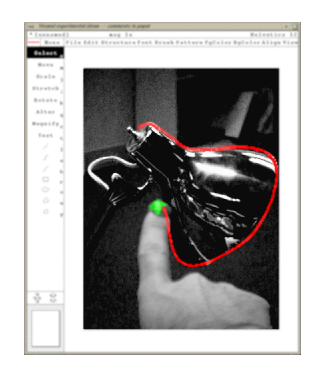
Figure 1: "SixthSense" Gesture-based 3D AR Wearable Computing, S. Mann, 1997[5]