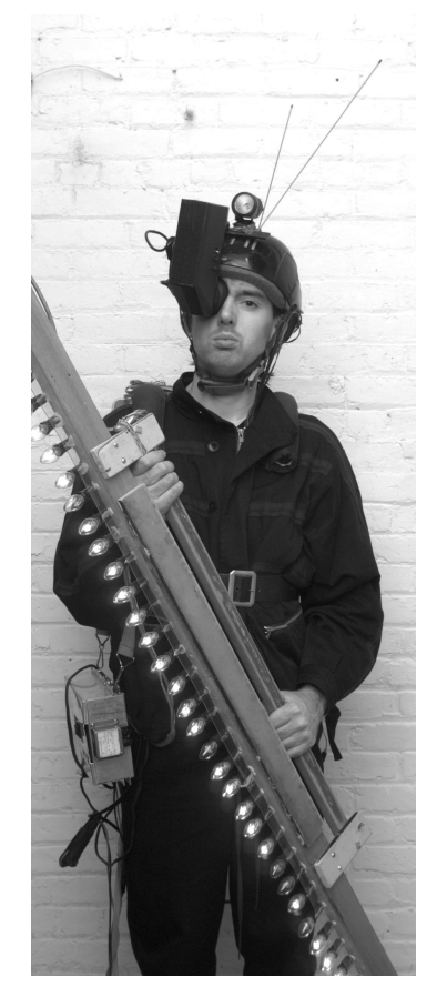
Figure 4: Historical context: abakographic "paintbrush" with wearable computing and sensors to visualize radio waves, sound waves, etc.: wearable computing and computational photography [1, 2].