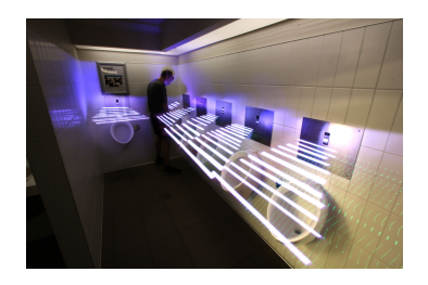
Figure 3: Abakographic User Interfaces allow us to sense sensing and visualize vision itself. Priveillance (privacy, surveillance, and sousveillance) becomes a new medium of artistic experession.